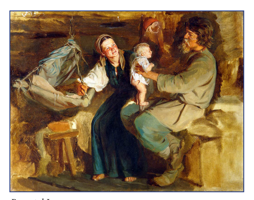
Parental Joy by Kirill Vikentevich Lemokh