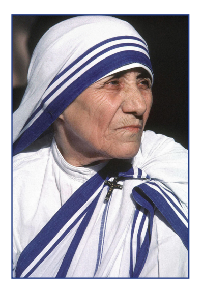
Blessed Teresa of Calcutta NEW DELHI, INDIA: (FILES) This undated photo shows Mother Teresa. Mother Teresa will be beatified, 19 October 2003, in a ceremony in St Peter's Square, Vatican. The beatification ceremony is the penultimate step to being canonised a saint and has been the shortest in modern history. Following the beatification, a second miracle has to be verified by the Vatican before Mother Teresa can be proclaimed a saint.

I do not understand why some people are saying that women and men are exactly the same, and are denying the beautiful differences between men and women. All God's gifts are good, but they are not all the same. As I often say to people who tell me that they would like to serve the poor as I do, "What I can do, you cannot. What you can do, I cannot. But together we can do something beautiful for God." It is just this way with the differences between women and men.