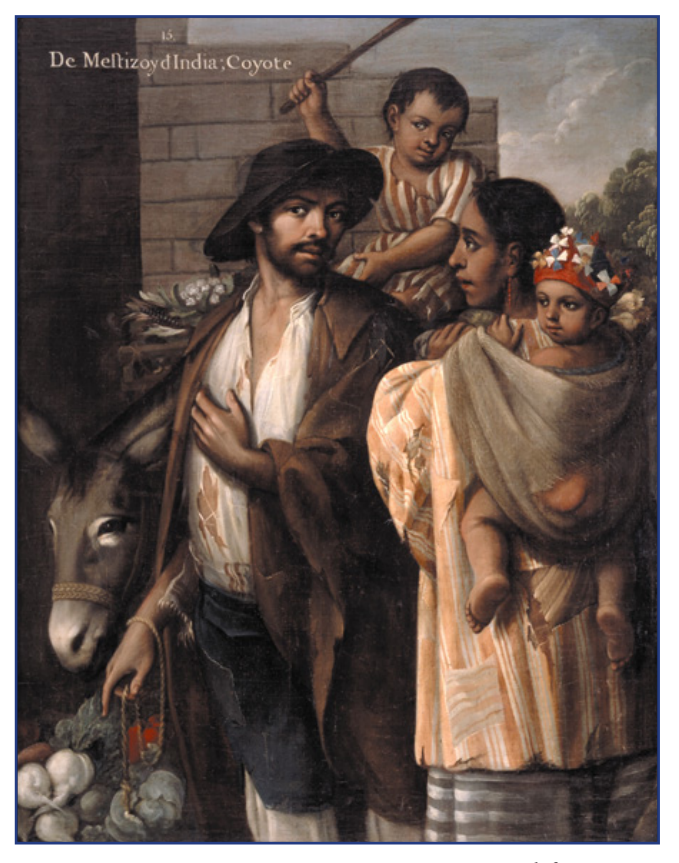
Casta Painting: No. 15. From Mestizo and from Indian; Coyote by Miguel Cabrera