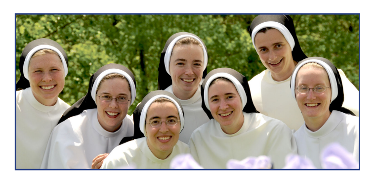
Dominican Sisters of Saint Cecila http://nashvilledominican.org

I began to pray even more, making a holy hour each day. I felt that God wanted me to be in St. Catherine's order. It is funny now to remember coming home from the January vocation retreat to the Diocese of Arlington and telling the priest at my parish, "I want to be a Dominican, but I am not sure where!" I had a hundred concerns about looking in the direction of Nashville. I was quieter than most of the sisters I had met, and I wasn't sure that I wanted to teach. But the more I prayed the more I felt that God was calling me south. I made a retreat at the Motherhouse and saw my attraction for the life expanding. I then returned a month later, this time convinced that this was where I belonged. I was accepted on Palm Sunday and spent the spring and summer in happy anticipation.