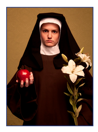
St Teresa Benedicta of the Cross