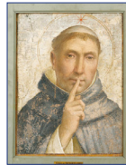
Saint Dominic founded the Dominican Order.

A religious order is a group of consecrated people who follow Jesus Christ through the pattern that their founder set. Many of them are named after their founders, who have become saints.