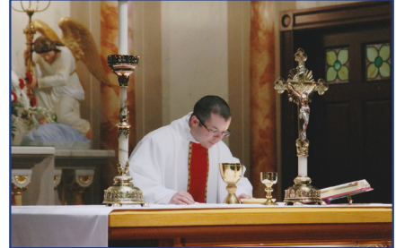
Priests Celebrate Holy Mass

Every day, priests hold in their hands God's greatest gift to humanity: the Eucharist. This "sacrament of sacraments" feeds the souls of God's people and is a sacrifice for the salvation of the whole world!