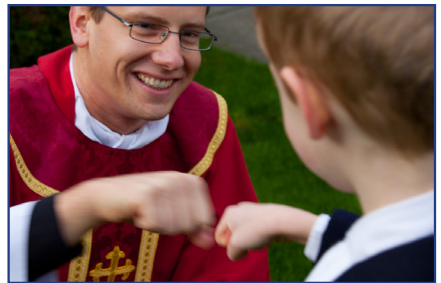
Priests Love All and Serve All

The first duty of every priest is to preach the Gospel of Jesus Christ. The Son of God was born as a man, suffered, died, and rose again for our sake! Priests spend their lives proclaiming this life-changing message!