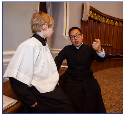
Priests Preach the Gospel

Every day, priests hold in their hands God's greatest gift to humanity: the Eucharist. This "sacrament of sacraments" feeds the souls of God's people and is a sacrifice for the salvation of the whole world!