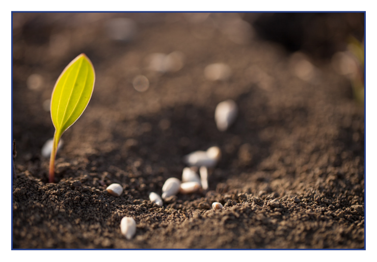
in the religious life, others in marriage, and still others as a single person. God will lead us to the kind of life where we will become the best version of ourselves.

"Just as some plants do well in the shade and others do well in sun, some people thrive in the religious life, others in marriage."