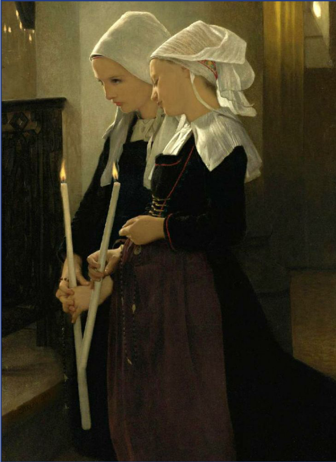
"Prayer at Sainte Anne d'Auray"

Study this image in light of today's theme of prayer.