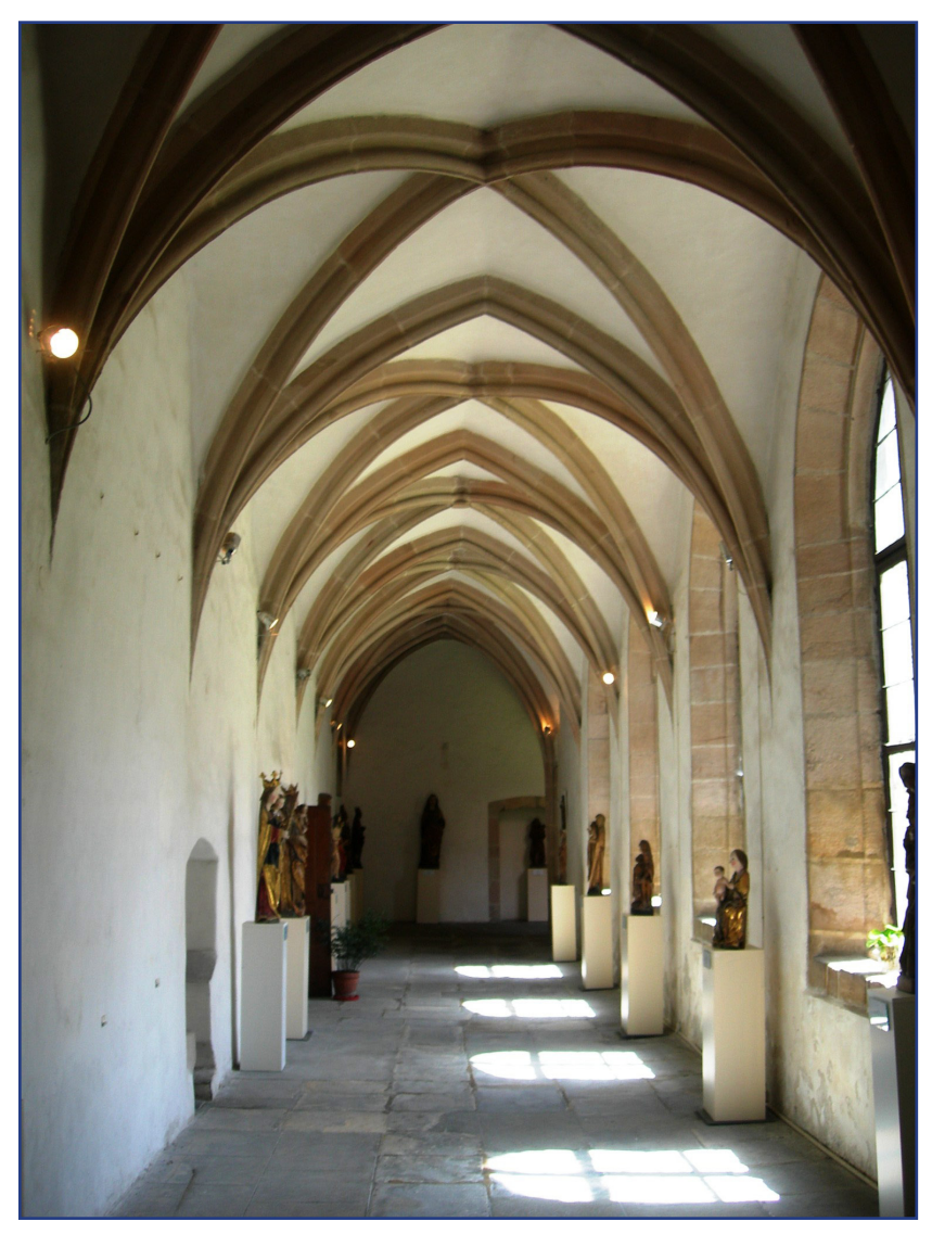
Beautiful colonnade leads to franciscan cloister