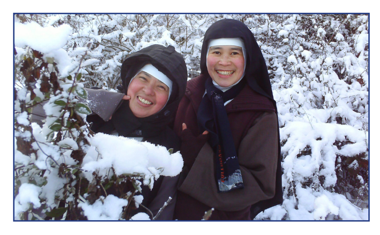
Poor Clare sisters enjoying a snowy day