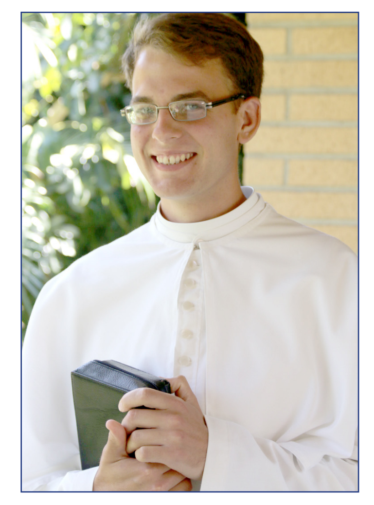
A young Norbertine at his Solemn Profession http://www.stmichaelsabbey.com/abbey/

There are about 50,000 religious sisters in the United States.