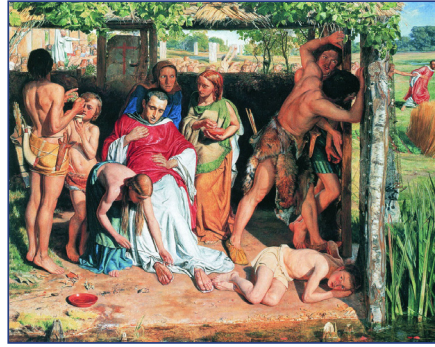
“A Converted British Family Sheltering a Christian Priest from the Persecution of the Druids” by William Holman Hunt