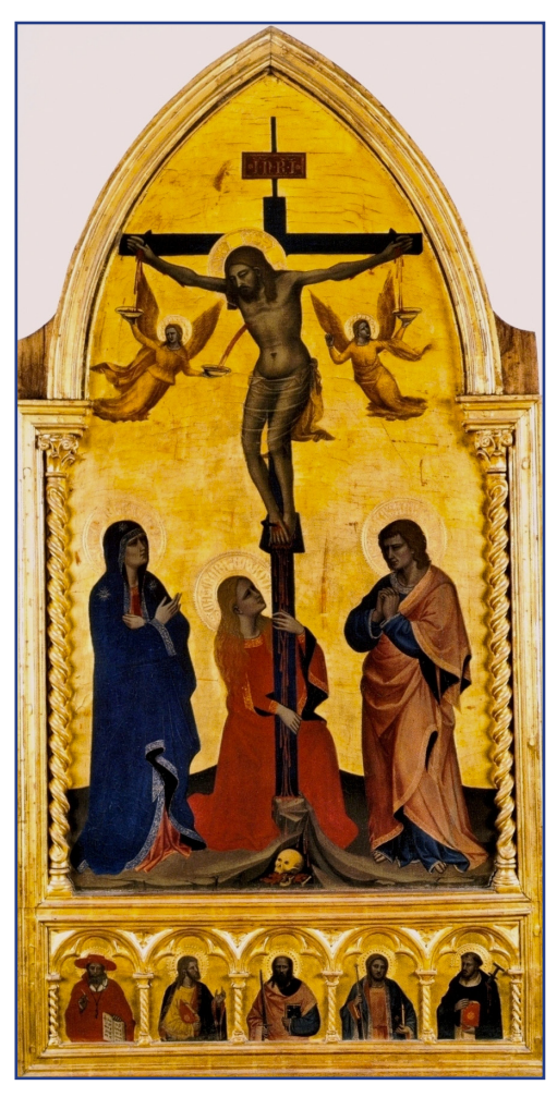
"Crucifixion," by Nardo di Cione