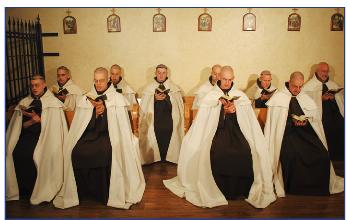
Carmelite Monks of Wyoming, chanting together in prayer