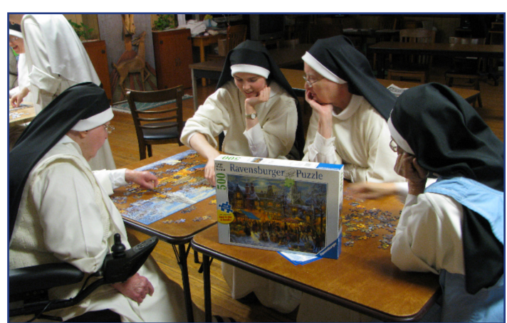
Dominican Nuns of Summit, NJ working on a puzzle together.

Answer the following questions while looking at the photographs: