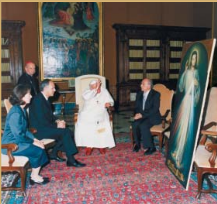
On June 28, 2003, Pope John Paul II blessed the Divine Mercy painting on loan to the Order from the Shrine of the Divine Mercy in Krakow, Poland.